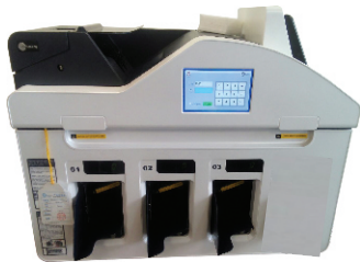
CM 300 With 3 pockets Equipped with an external stacker converts 3 pockets to 6 receiving pockets.