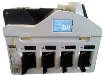
CM 400 With 4 pockets Equipped with an external stacker converts 4 pockets to 8 receiving pockets.