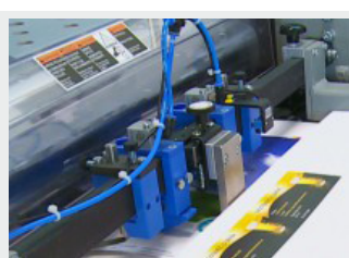
Bottom suction feeder