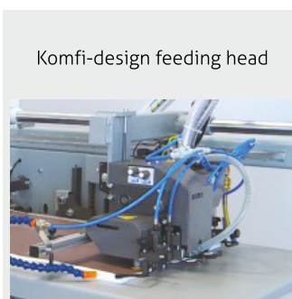
Komfi-design feeding head