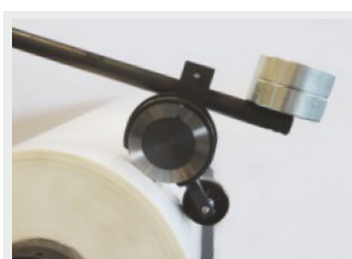
Film slit (option)