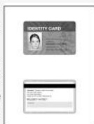
ID Copy Function

The bizhub 185e/165e is a full-featured 3-in-1 MFP designed to meet printing, copying and scanning needs, yet be simple and intuitive to use. The operation panel features a Shortcut key, which can be freely assigned to one of four commonly used copy functions (Combine Original 2-in-1, Sort, Erase, and Book Separation), as well as an ID Copy key for copying both sides of small-sized documents to one page, function keys for instant access to print settings, numeric keys and a reset key. A unique LED Status Display and clear Error Status Indicator offer at-a-glance visual feedback even from a distance, while LED-backlighting ensures a bright, readable display. Routine maintenance tasks and paper replenishment have also been simplified to minimise downtime and maximise productivity.