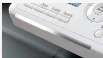
LED Status Display